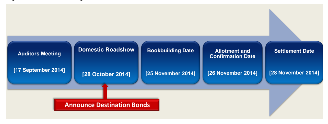
Figure 2: Bond Switching Timeline

PDMO has scheduled the inaugural Bond Switching to be in November 2014. In this transaction, "LB155A" will be the source bond and the destination bonds will be announced in the Domestic Bond Switching Roadshow on 28<sup>th</sup> October 2014. Bangkok Bank Public Company Limited, Kasikorn Bank Public Company Limited and Standard Chartered Bank (Thai) Public Company Limited are the joint lead managers of this transaction as well as other Bond Switching and Bond Consolidation transactions which will occur in FY2015. The timeline of the inaugural Bond Switching is shown in figure 2.